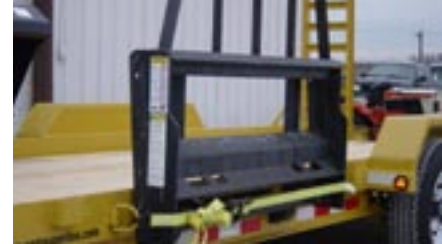
Pallet Fork Carrier