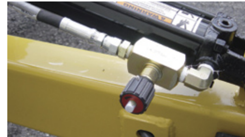
Adjustable Cushion Cylinder