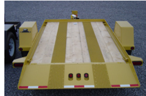
Forklift Tread Package (optional)