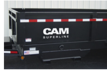
Pallet Fork Carrier & Tie Down Rail (optional)