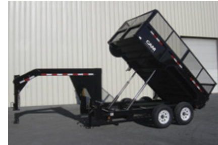
Gooseneck & Expanded Metal Sides (optional)